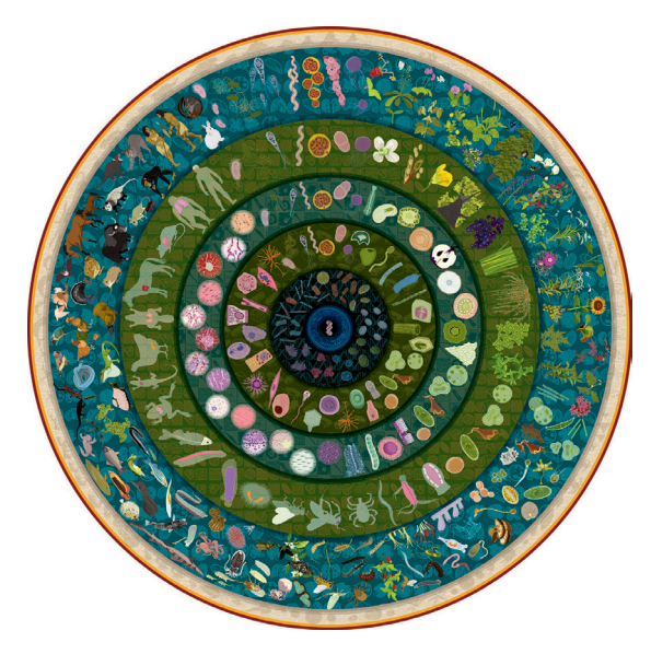
Illustrated by Manabu Nakagawa, Kanya Ozaki

Biohistory Mandala represents the hierarchy of living creatures by a series of concentric circles. A DNA that means the genome in the cell is placed at the center of the circles. Organelles in the cytoplasm of the cells surround it and form a cell. In the next layer, tissues composed of cells are seen followed by organs which are structural and functional unit of animals and plants composed of some tissues. In the outer layer, you can find all kinds of living creatures that are organized by the organ systems and form ecosystems with abundant nature. The outmost layer shows the history of the evolution of organisms and extinct creatures are drawn like fossils. The processes from a cell to individual also represent the development of organisms. Biohistory Mandala comprehends both evolution and development of creatures.